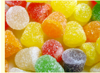
Creative Challenge July