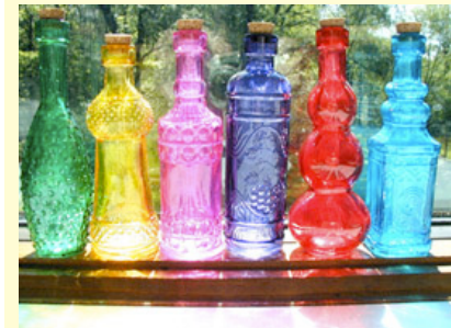
Creative Challenge June